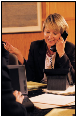
CWICs will follow along with participants in work incentives planning.